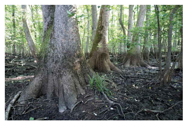
Watermark on trees, Roanoke River wetlands