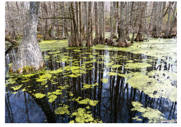
Cypress Swamp at Merchants Millpond State Park

Water in a wetland can come from many places. It might come from a stream or river, precipitation like snow or rain, seasonal floods, or ocean tides. If water comes often enough and stays long enough to change the soil chemistry, then we will find a wetland. Wetlands like swamps and marshes usually have a lot of water, either right at the ground surface or above it. Other types of wetlands, like vernal pools, might dry out for part of each year, but there is still plenty of groundwater hiding just beneath the surface. These wet conditions provide just the right habitat for wetland plants to grow.